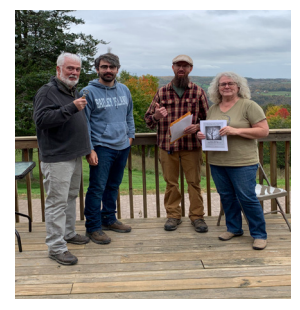
We registered over 1700 hours of volunteer commitment onsite and in the community.