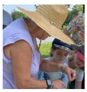
We offered a full calendar of in-person and virtual workshops for children, families, and adults, including nature education and other topics.